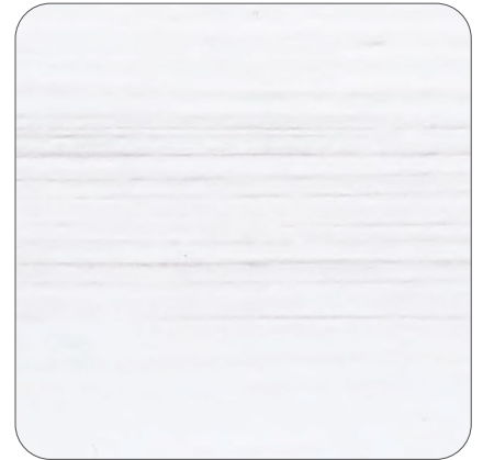
Anderson Pine White R55011 RU