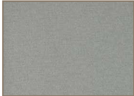
Brushed Aluminium F8110VV