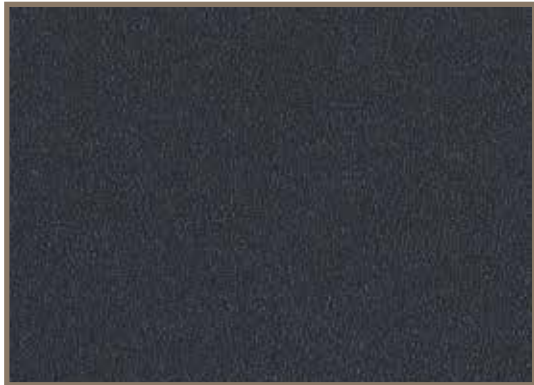
Anthracite Metallic U506MP