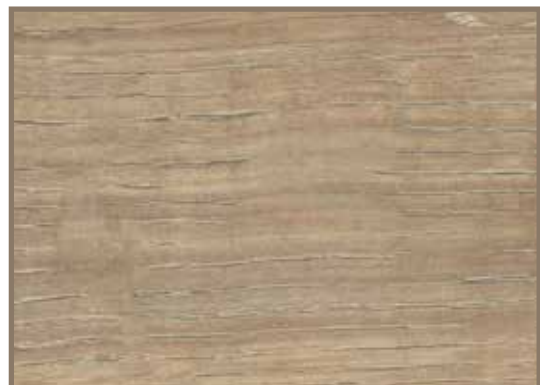
Odeon Oak Sand F06/182MO

Actual finish may vary in colour to digital representation. Please contact our sales team for a finish sample. Other finishes available - Price on application.