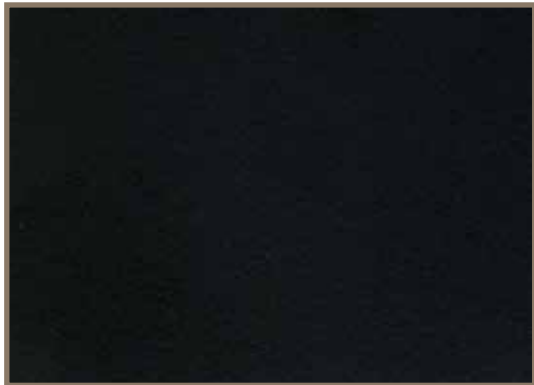
Volcanic Black U1200VV