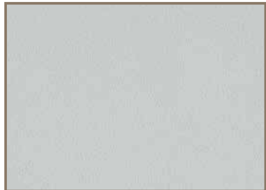
Light Grey U1188MP