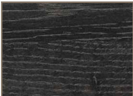
Odeon Oak Black F06/184MO